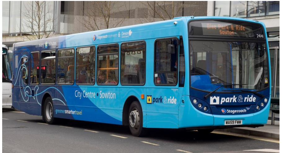
Park and Ride can help reduce the impact of traffic on local air quality

Poor air quality negatively affects human respiratory and cardiovascular systems and is linked to asthma and mortality. In the short-term, high pollution episodes, associated with heat waves for example, can contribute to premature death for people who are already vulnerable to daily changes in air pollutants. Anthropogenic particulate matter contributes to 29,000 premature deaths per year i , reduces life expectancy in the UK by six months and has a health cost of £19 billion ii . Populations particularly sensitive to the health effects of air pollutants include the elderly; pertinent in Devon and Torbay where the average age of residents is higher than the national average iii .