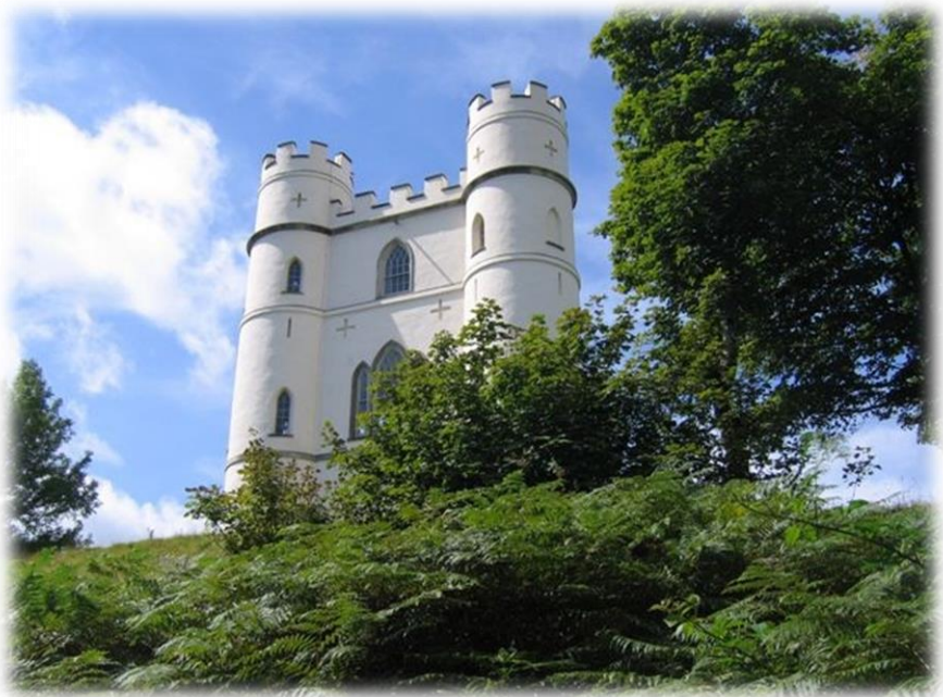
Haldon Belvedere (also known as Lawrence Castle), a Grade II* triangular tower, stands at a prominent position of the hills overlooking the Exe Estuary.

The number of assets on the Heritage at Risk Register in the South West continues to fall. This is true for Devon and Torbay other than the number of buildings registered as 'at risk' in Devon, which is rising. None of Devon's 10 protected wreck sites is on the register.