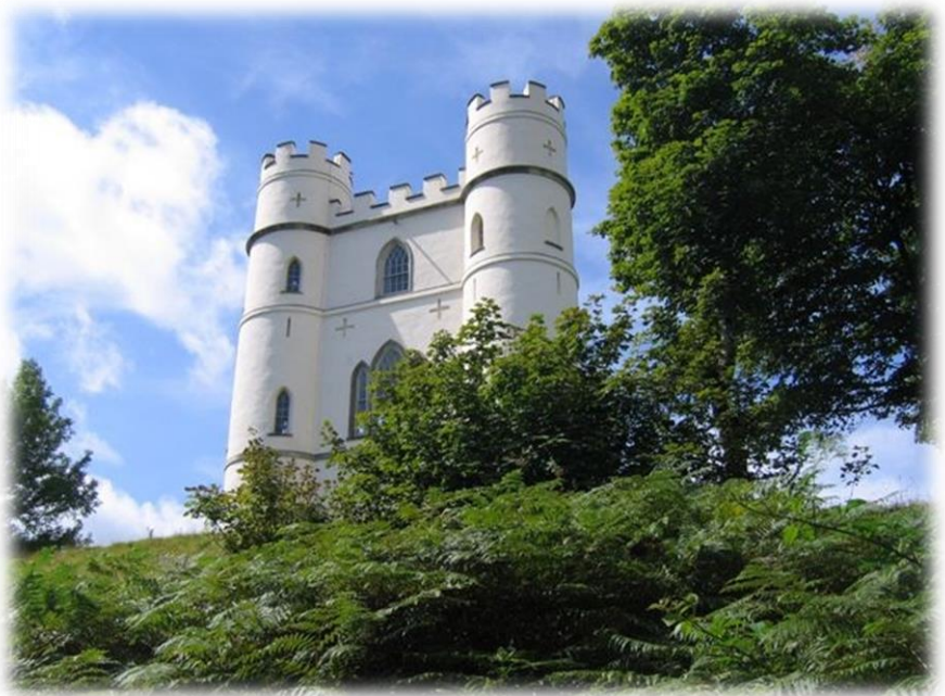
Haldon Belvedere (also known as Lawrence Castle), a Grade II* triangular tower, stands at a prominent position of the hills overlooking the Exe Estuary.

The number of assets on the Heritage at Risk Register in the South West continues to fall. This is true for Devon and Torbay other than the number of buildings registered as 'at risk' in Devon, which is rising. None of Devon's 10 protected wreck sites is on the register.