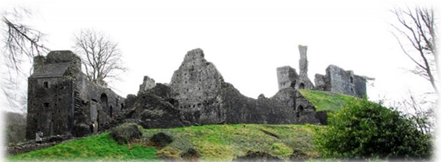
Okehampton Castle is a medieval motte and bailey castle built between 1068 and 1086. It is now a Grade 1 listed building.